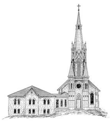
St. Mary of the Assumption Owen Sound

Email: smm@bmts.com www.stmarysandthemissions.ca